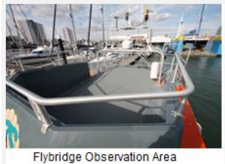
Flybridge Observation Area

She is a multi-purpose, strongly built functional workboat. Deck features include a large working deck area, a forward crew transfer area, an open flybridge observation area, a moonpool and a structural mounting area for a crane.